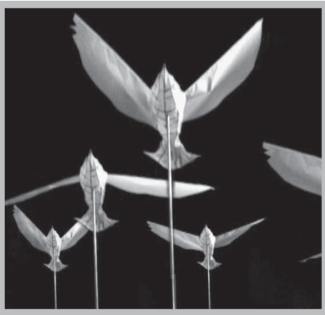
Above, an interactive/mechanized work called "Her Flock" may be seen in the Virginia Intermont College Fine Arts Center Gallery.