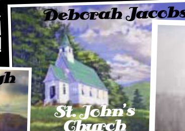
excellent framing available!